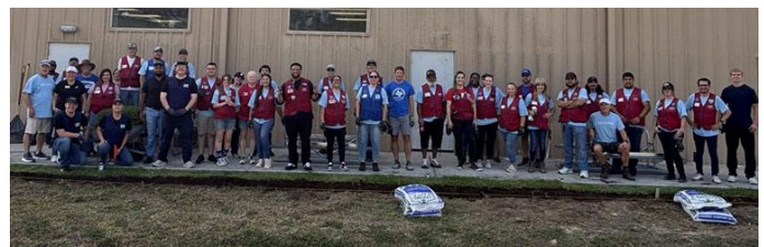
Team Effort - Lowe's managers and store representatives, board members, PB staff and the EFTA volunteers unite for big impact

NASHVILLE NIGHTS captured the spirit of community and support behind Project Beacon with lively music and heartfelt giving.