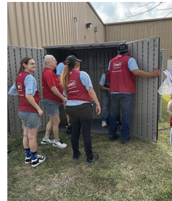
Building more than storage - shaping a vision into reality

COMMUNITY SUPPORT: Lowe's Red Vest Day transformed the BAC outdoor space into an expanded learning environment for our clients while uniting corporate volunteers and the community around a shared purpose.